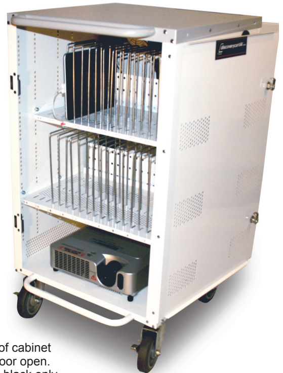
Front of cabinet with door open. Avail. in black only.